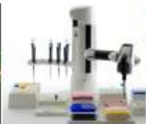
VIB TECH WATCH